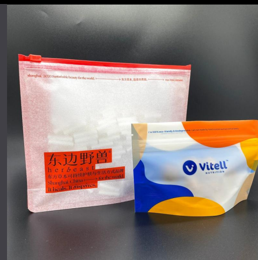
Biodegradable zipper food pouch