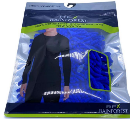
Touching air hole clothes bag with hook