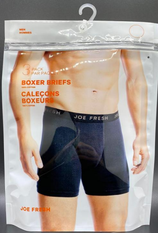
Glossy men underwear bag