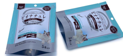
Mylar sachet for cat food