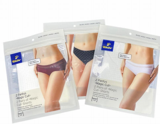
Matt women lingerie bag