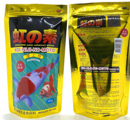
Stand up zip bag for fishing lure