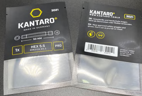
Matt bag for hardware tool packing