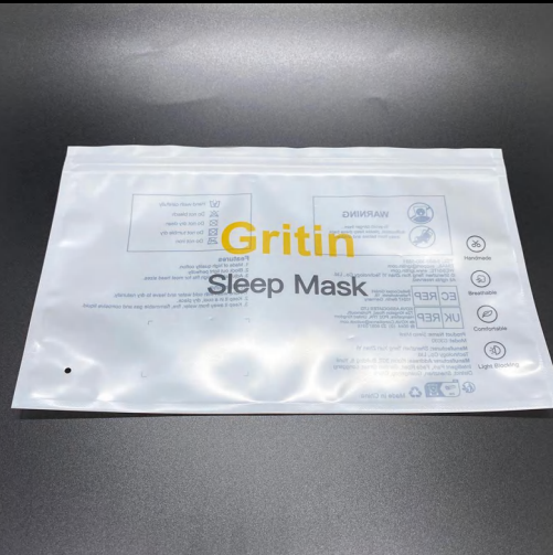
Zip bag for sleep mask packing