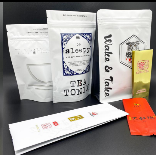
Tea satchel/ pouch