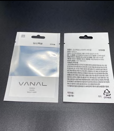
Matt mylar bag for hand sanitizer