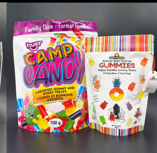
Gummy candy bag