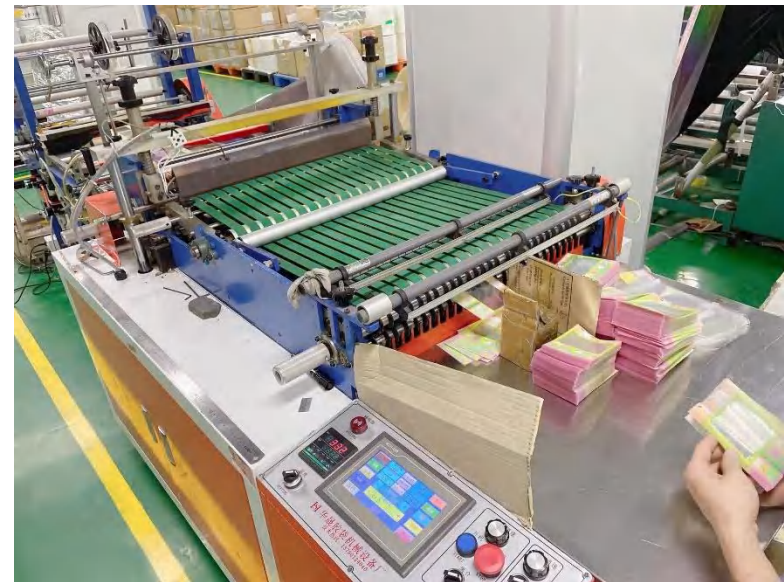
Side sealing bag making machine