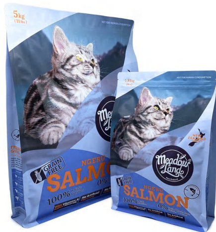
Large 10kg 5kg zipper pouch for cat food