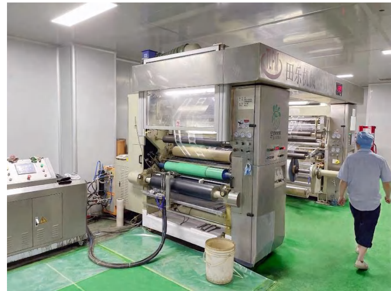
High speed solvent-free compound machine