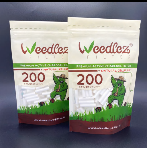
Recycled bag for filters