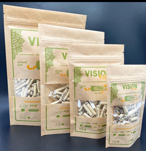
Kraft paper bag for filter packaging