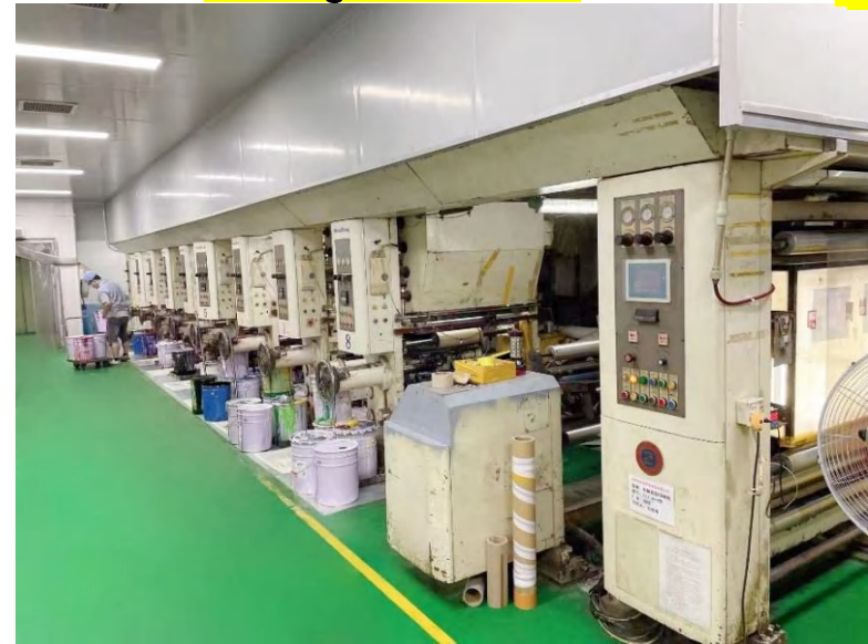
8 colors high speed cylinder gravure printing machines