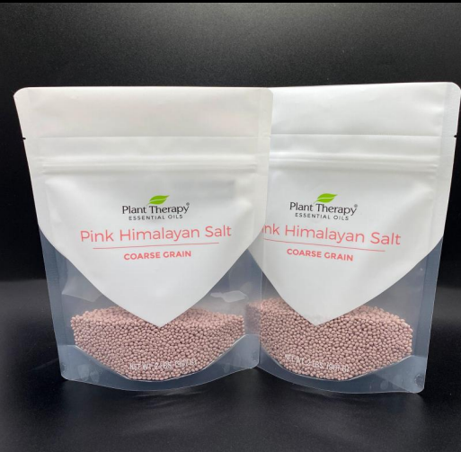
Biodegradable zip pouch for himalayan salt