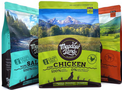
Flat bottom AL foil zip bag for dog food