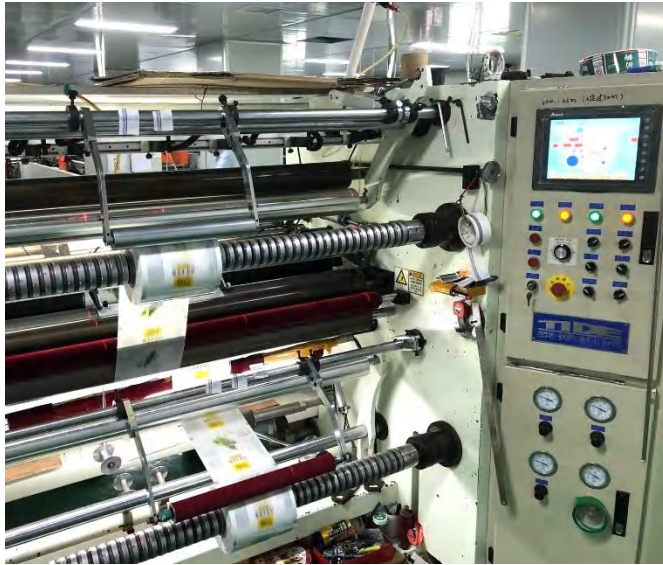
No.1 slitting machine workshop