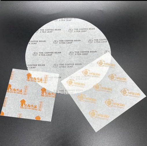
Baking paper/parchment paper