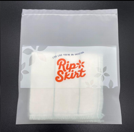
Biodegradable frosted clothing polybag