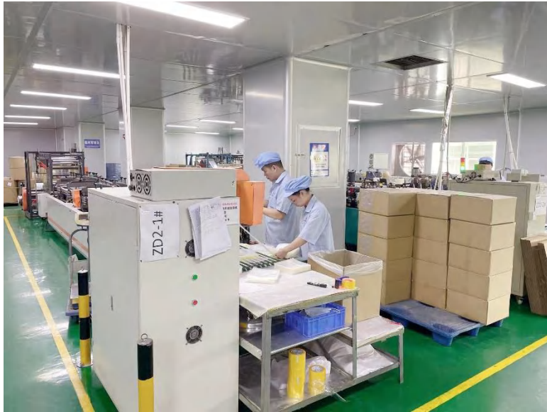
No.1 bag making workshop - The 3th floor