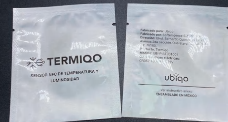
AL foil bag for temperature sensor