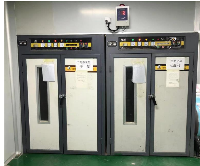
Curing oven room