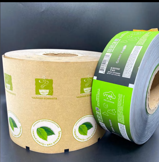
Automatic film roll packaging