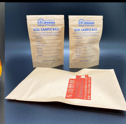
Kraft paper biodegradable bag