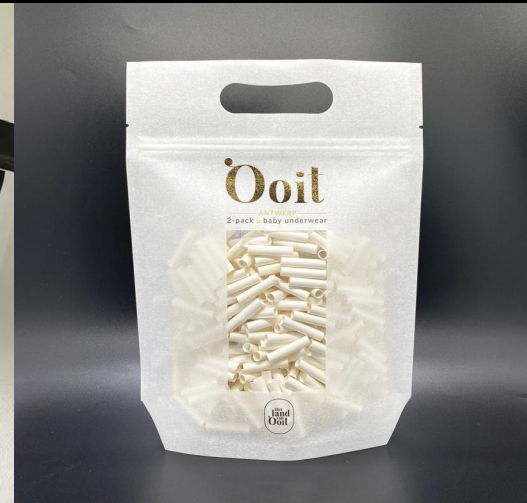
Cotton paper biodegradable bag