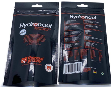
Pouch for thermal grease packing