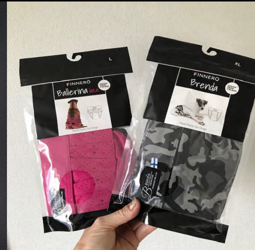
Biodegradable bag for dog pet clothing