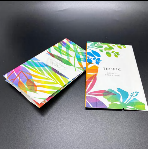
White kraft paper bag for face cloth