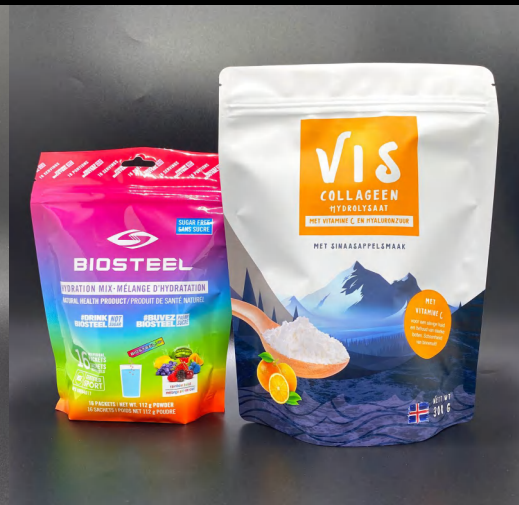
Powder packing pouch