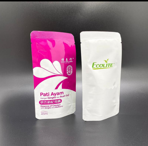
121/135 degree high temperature resistance retort pouch