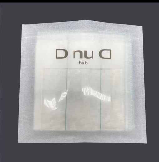
Biodegradable cellulose zip underwear bag