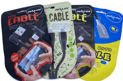
Ziplock bag for cable packaging