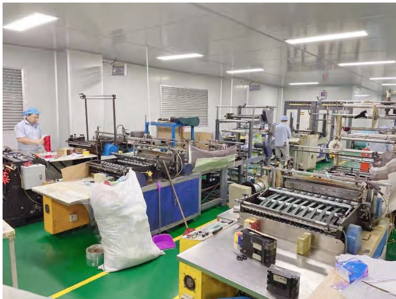
No.2 bag making workshop - The 2nd floor