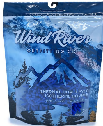
Bag for wool thermal underwear