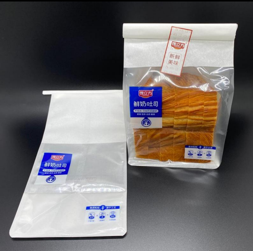
Tie tin bread bag