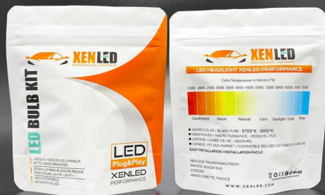
Antistatic bag for LED bulbs packing