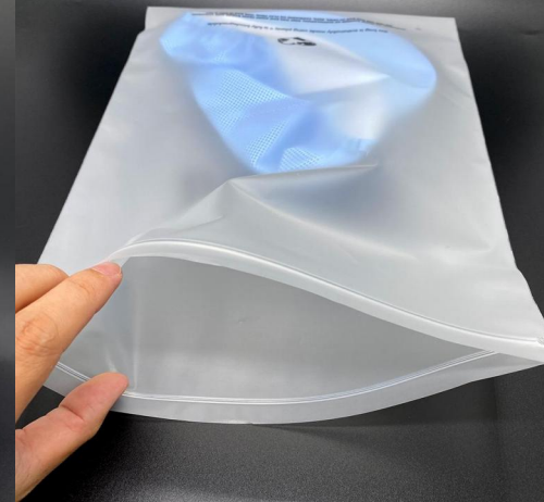
Biodegradable frosted zip garment bag