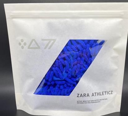
White Kraft paper clothing bag