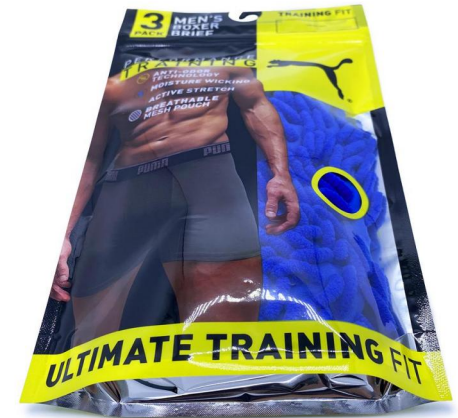
Man underwear bag with hook