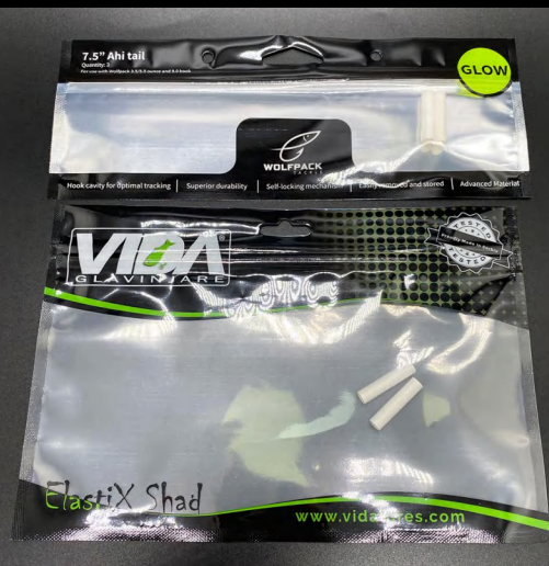
Zip lock bag for fishing lure/tackle