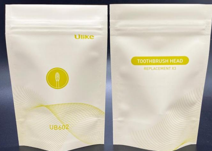
Zipper bag for toothbrush head