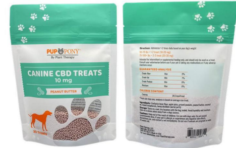
Biodegradable zip pouch for dog treats