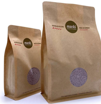
Kraft paper rip zip pouch for pet food