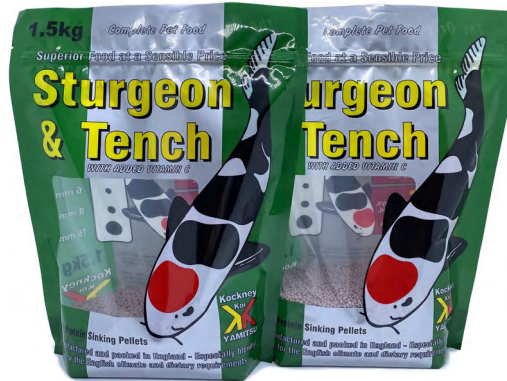
Window ziplock pouch for fish food