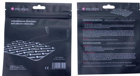
Bag for self-ahesive electrodes