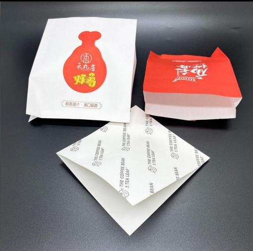
Hamburger fried chicken paper bag