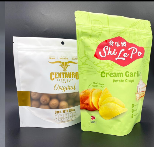
Beef jerky snack mylar bag