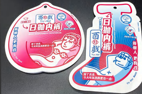
Shaped disposable underwear bag