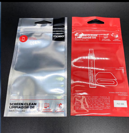
Ziplock bag for screen clean packing