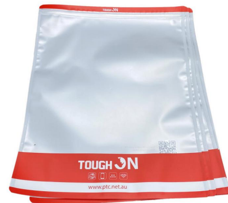
Zip bag for phone PC accessories