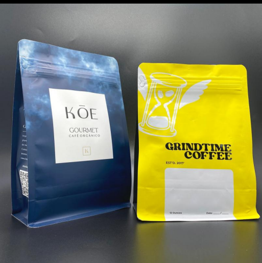
Flat bottom coffee bags