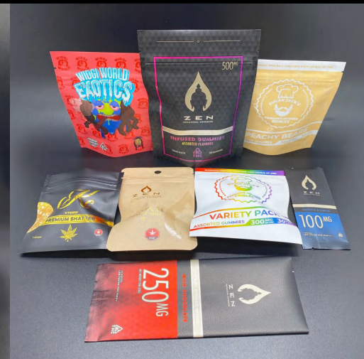
CBD THC weed cannabis mylar bag