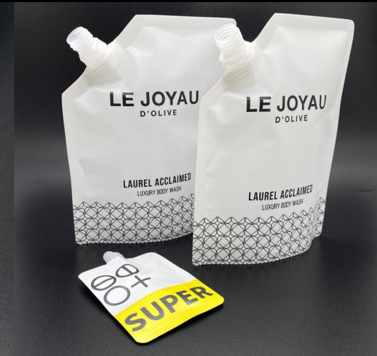
Spout pouch for shampoo body wash