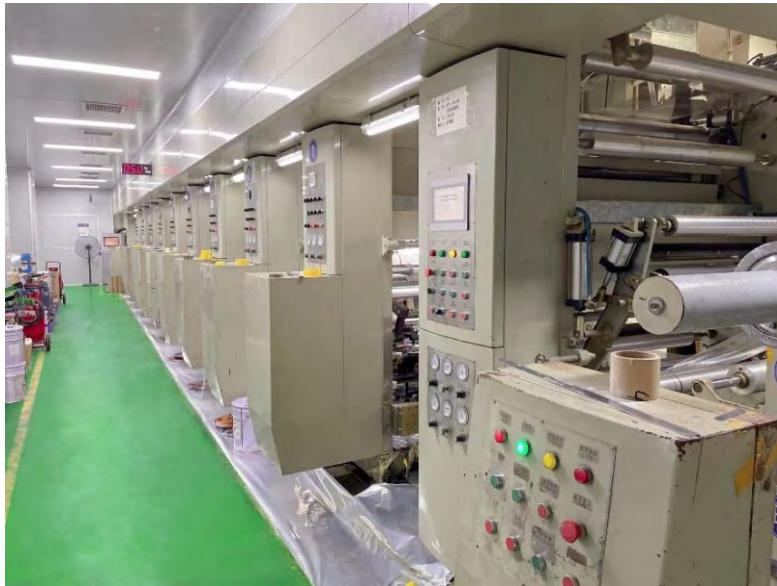
9 colors high speed cylinder gravure printing machines