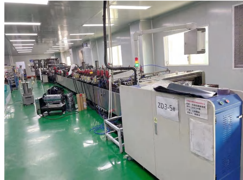
Most advanced flat bottom bag machine