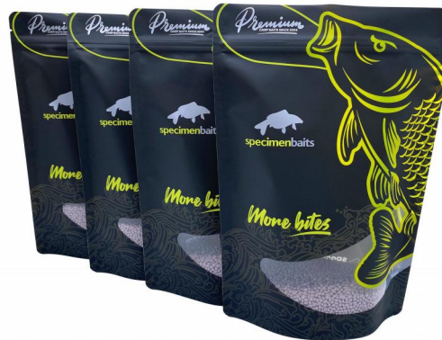
UV spot printing pouch for fishing bait